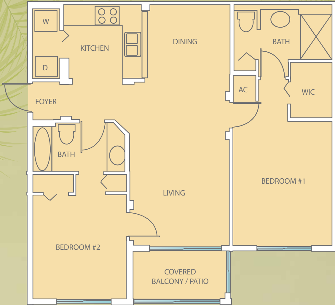
Type II: Includes buildings 3, 9 and 10

985 AC - sq. ft. 98 LCE - sq. ft. 1,083 sq. ft. Total